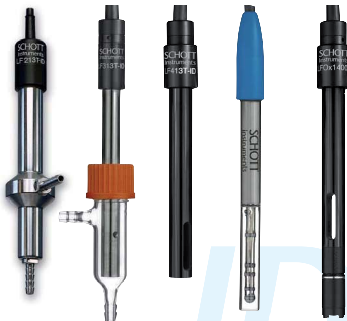
LF 213 T-ID

* LFOX 1400 ID additionally with oxygen measurement