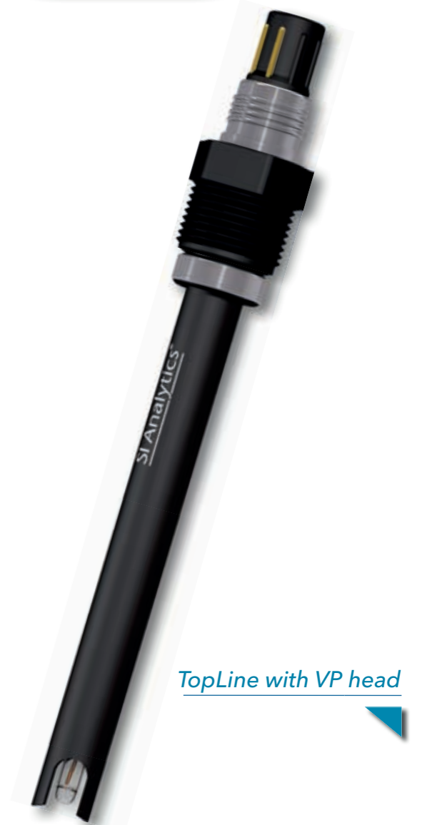
TopLine with VP head